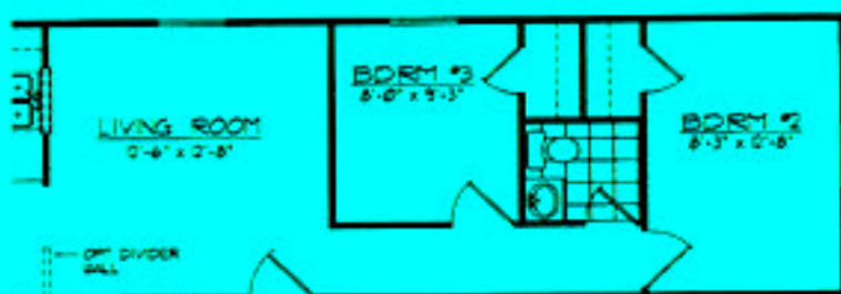
OPT. HALF BATH