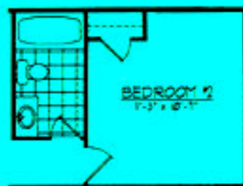
OPT. FULL BATH